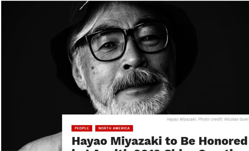
Hayao Miyazaki.