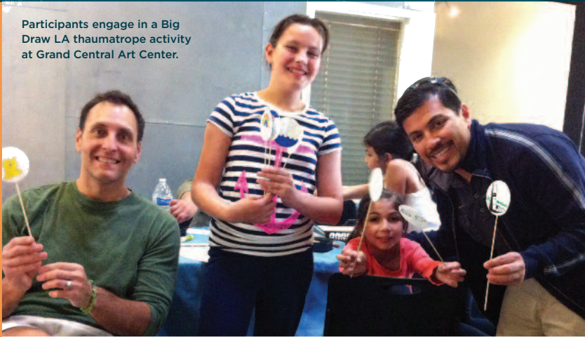
Participants engage in a Big Draw LA thaumatrope activity at Grand Central Art Center.