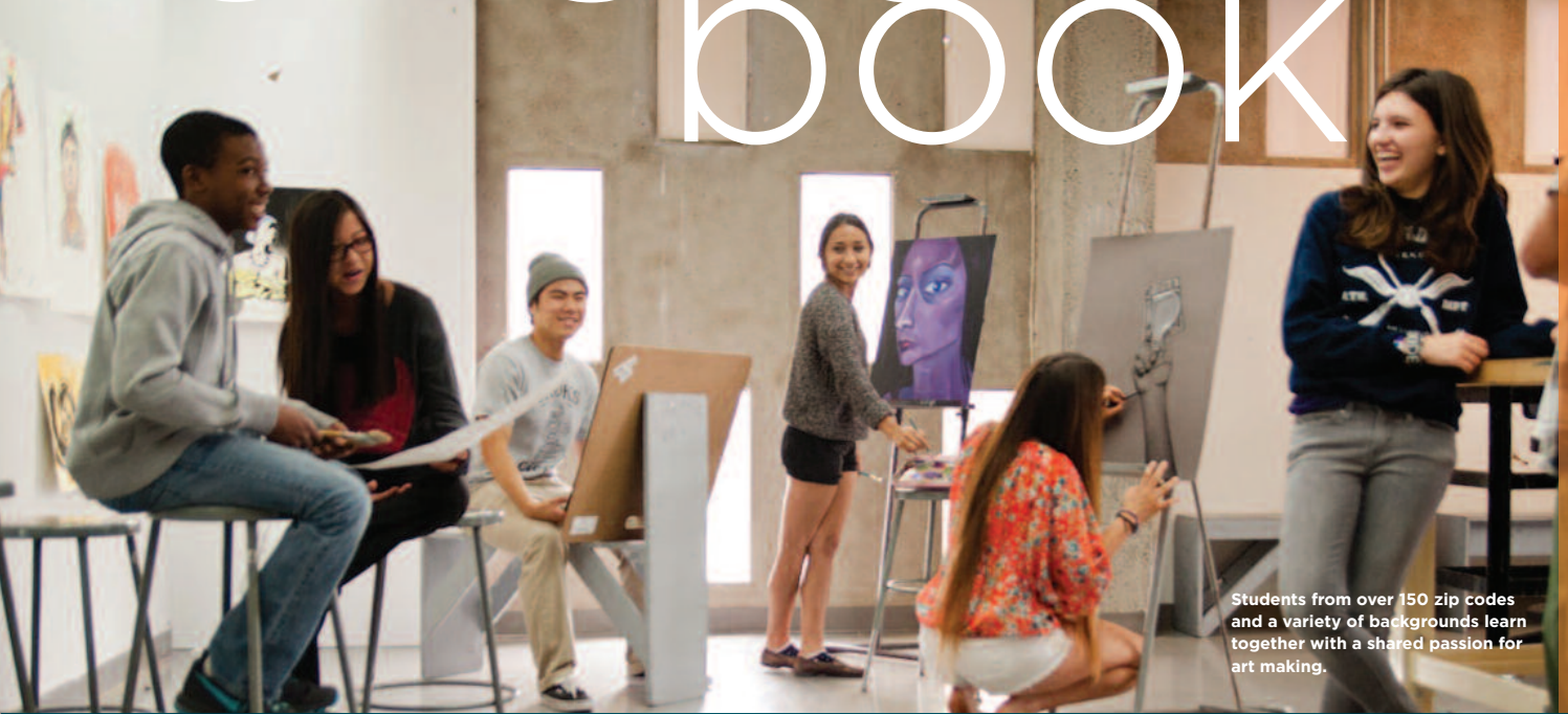
Students from over 150 zip codes and a variety of backgrounds learn together with a shared passion for art making.