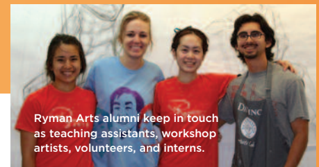
Ryman Arts alumni keep in touch as teaching assistants, workshop artists, volunteers, and interns.

9% were alumni from 1991-1998. 12% were alumni from 1999-2006. 79% were alumni from 2007-2013.