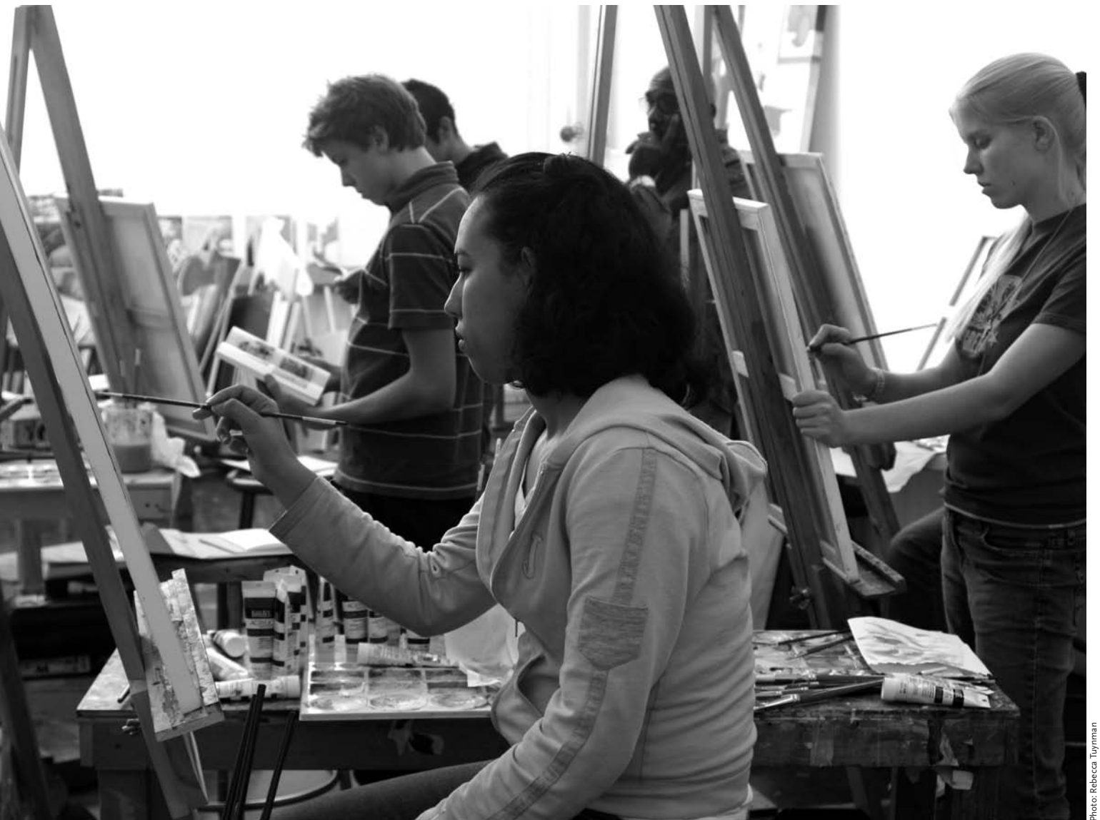
The Spring 2006 Advanced class refines their paintings for the exhibition and graduation.