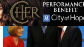
It's a strange year for gender in politics