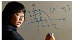
Los Angeles teacher ratings