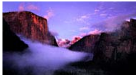
The ultimate guide to Yosemite