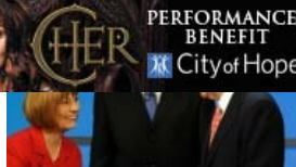
It's a strange year for gender in politics